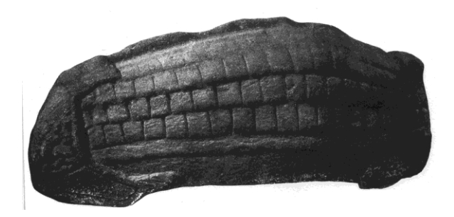
Plate 1: Hogback stone from Old Govan Parish Church, Glasgow c. 9-11 century.

In the same year that the stones were set on record, an elaborately carved sandstone sarcophagus was found while digging a grave in the south east corner of the churchyard. Originally, there were three such relics at Govan church in the 18<sup>th</sup> century but today we only have this one which is thought to have been used to contain the body or relics of Saint Constantine. Although claims have been made that the coffin is 6<sup>th</sup> or 7<sup>th</sup> century, stylistically, the carving indicates a later date in the 10th or 11th centuries. While the saint's identity remains uncertain the decorative style of the sarcophagus could mean that it is actually the remains of King Constantine's own sarcophagus from the late 800's or early 900's. This would then be the reliquary of a dynastic saint of the Scottish royal house. Besides the style of its embellishment it is almost certainly a cult reliquary for a royal burial for it depicts a helmeted and sword wearing horseman out hunting stags with his dog, which is well known symbolry for a Royal hunting scene. **xxxvii**